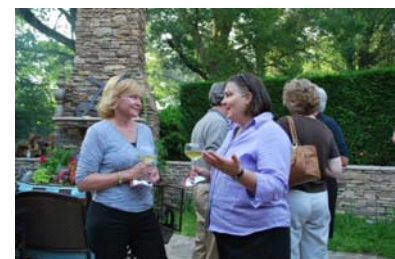
Students celebrate after class

Who else will be there: All our insurers will be represented as we discuss openly the keys to writing good accounts in 2010 and beyond.