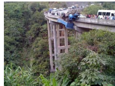
Wonder if he lost his LOAD?